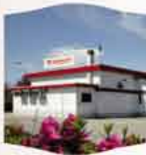
CAMPOLONGO AL TORRE

The journey into the world of Dentevano specialities continues, with lots more delicacies to discover.